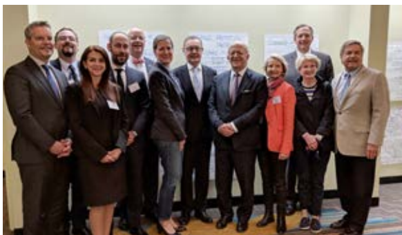
All chapter network meeting in Cincinnati - May, 2018.

Do contact us if you are travelling to any of the cities where we have sister chapters! We can connect you with your fellow EACC members outside of New York!!