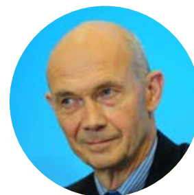
Mr. Pascal Lamy, Former Director-General of the World Trade Organization