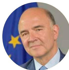
Mr. Pierre Moscovici, European Commissioner for Economic & Financial Affairs, Taxation and customs