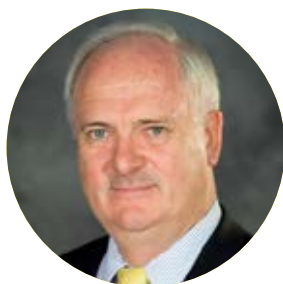
Mr. John Bruton, Former Irish Prime Minister, and the first EU Ambassador to the U.S.