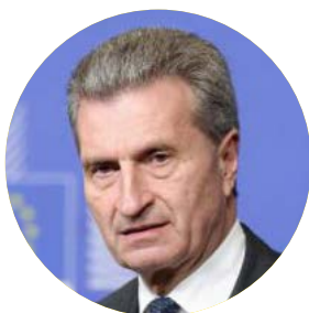
Mr. Günther Oettinger, European Commissioner for Budget