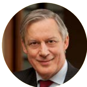
Mr. Christian Noyer, Former Vice President of the European Central Bank & former Governor of the Bank of France